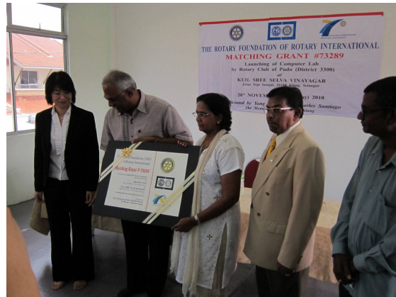
SMK Dato' Onn