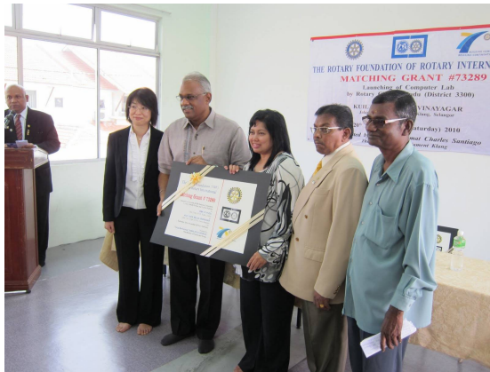
SMK (P) Pudu

We had a total of 100 people in attendance at the meeting hall. They were parents, students, members of the press, representatives of the temple, headmistresses from two schools, teacher advisors and Rotary Club of Pudu Rotarians.